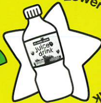
Lower sugar juice drink