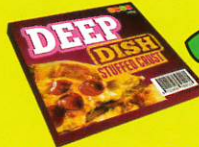
Lunch or Dinner