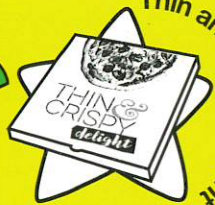
Thin and crispy delight