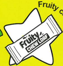
Fruity chew loaf